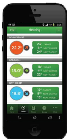
LightwaveRF App showing heating control.