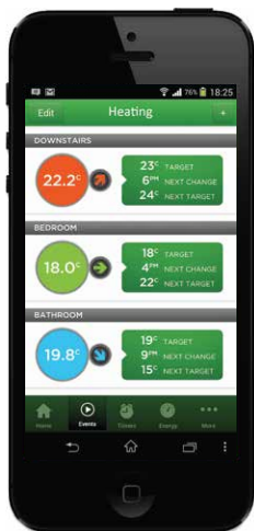
LightwaveRF App showing heating zones.